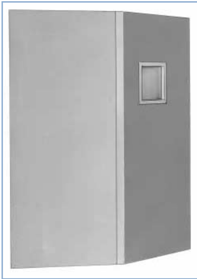
Sample Construction Detail