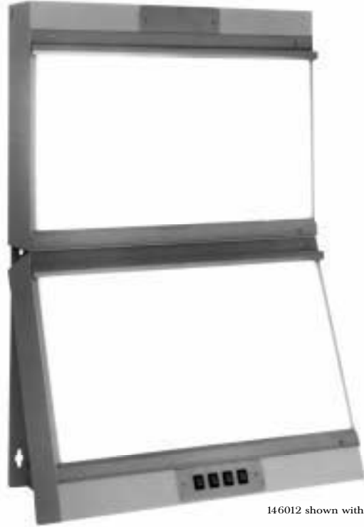
146012 shown with optional Console Arms at 20°angle (140272-20)

Specially designed for viewing 24x30cm (146000 Series) or 18x24cm (147000 Series) film, these series of illuminators feature very bright and even lighting in each viewing panel. The 146000 series has three F14T8/D daylight fluorescent bulbs per viewing section and the 147000 has two F14T8/D bulbs per section. Both series use electronic ballasts to produce flicker free lighting. Each section is individually controlled by an on/off rocker switch, thus allowing the person reading the film to reduce peripheral glare by simply switching off the sections not in use. To further reduce glare and prevent light spillover, the illuminators are provided with divided sections.